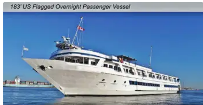
183' US Flagged Overnight Passenger Vessel